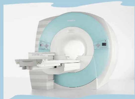
SIEMENS 3.0T MRI

We utilize a scanning technique that is unique to our 3.0T system. Obtaining sub-millimeter T2 images, we can provide reconstructions in multiple planes.